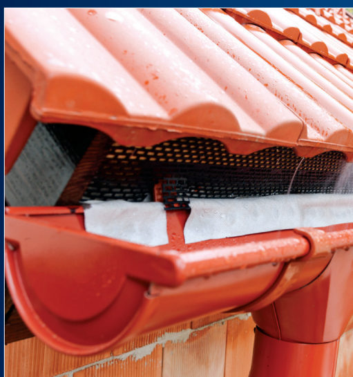
Typical rainwater gutters used in residential areas