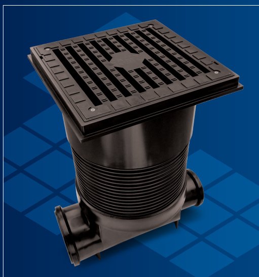
CHEZY Rainwater Sump

The CHEZY 300mm Rainwater Sump offers a new stylish aesthetically pleasing and leak proof alternative to the traditional sumps and allows for up to 3 incoming pipes.