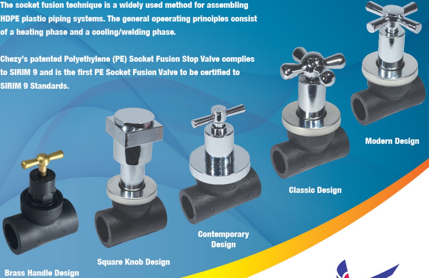
Brass Handle Design

Chezy's patented Polyethylene (PE) Socket Fusion Stop Valve complies to SIRIM 9 and is the first PE Socket Fusion Valve to be certified to SIRIM 9 Standards.